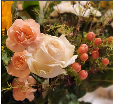
The last few months, we have been spoiled with flower donations! The residents have loved making flower arrangements!